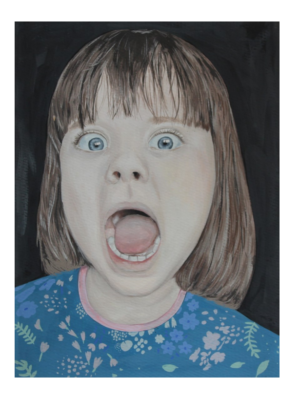
By Holly Moss, S5