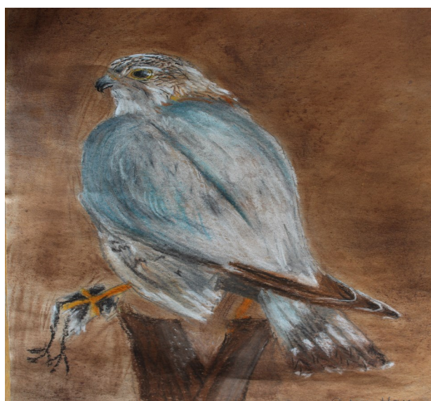
Artwork by Calum Hay, S3

Prefects are expected to: - wear school uniform - have agreed a meaningful course of study with their Pupil Support teacher - be a positive and supportive presence for peers and younger pupils - take on responsibilities which support good learning, positive ethos and the smooth running of the school - represent the school in the local community