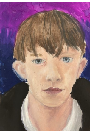
By Cain Courtney, S1