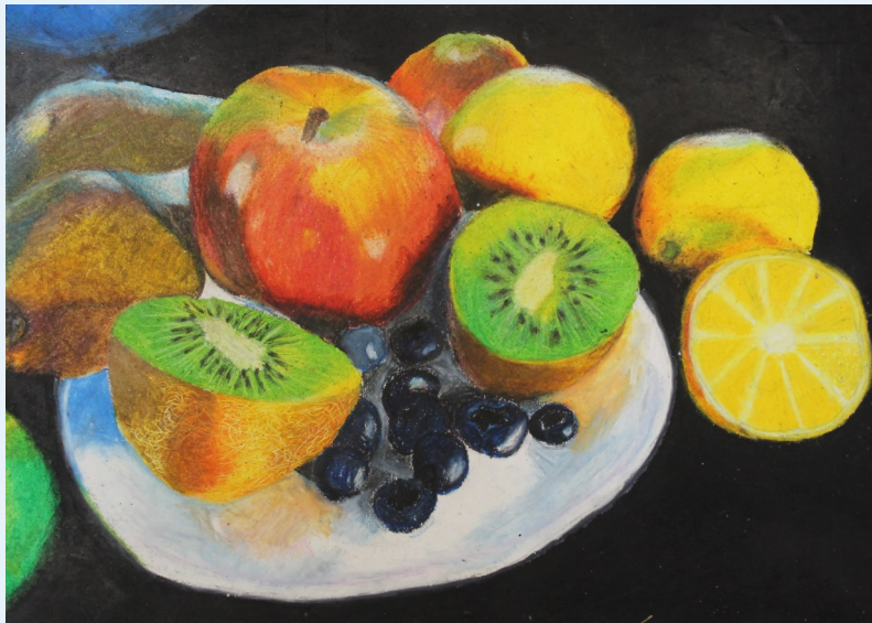
By Eilidh-Ann MacLean