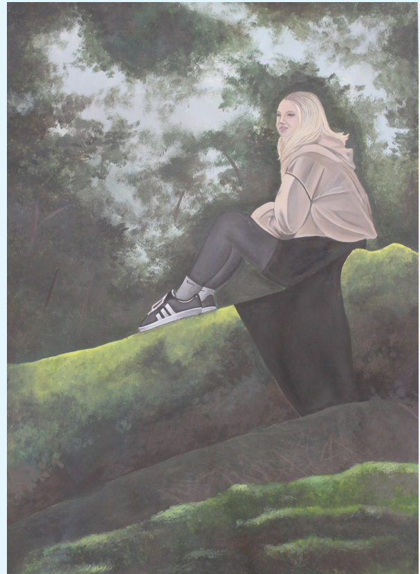
By Ava Ferreria