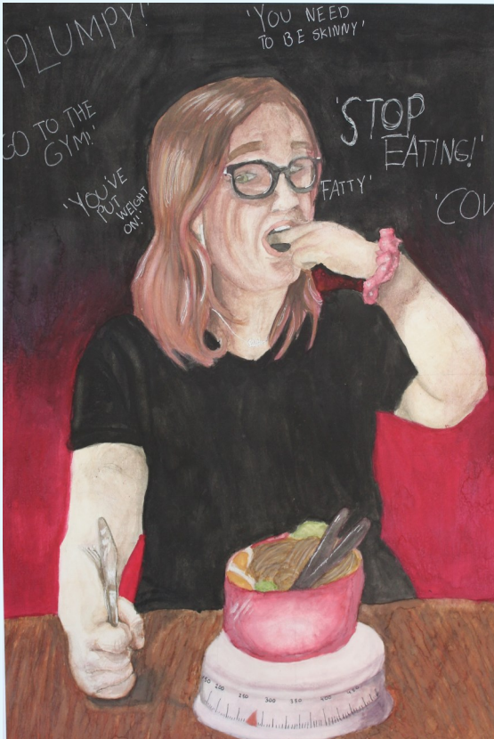
By April McLay