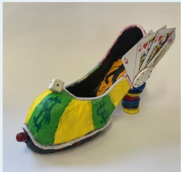
By Nell MacDonald, S3