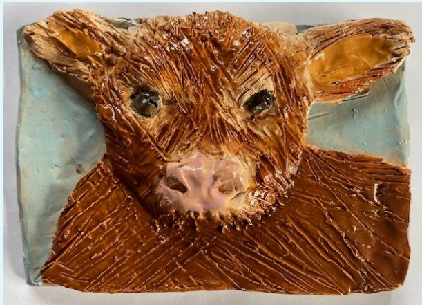
By Finlay Clarke, S1