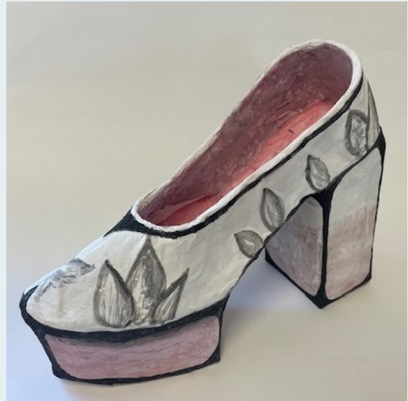
By Maisie Rendall, S3