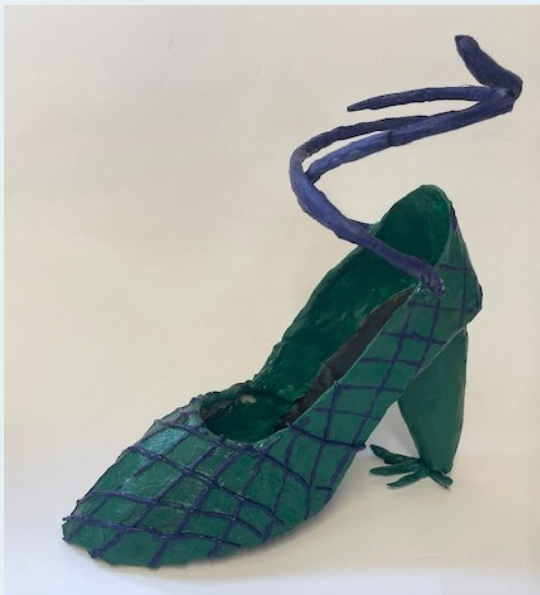
By Lexi Cox, S3