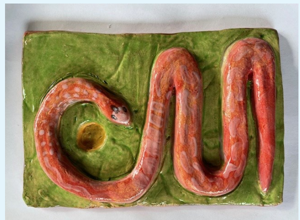
By Niamh Hill, S1