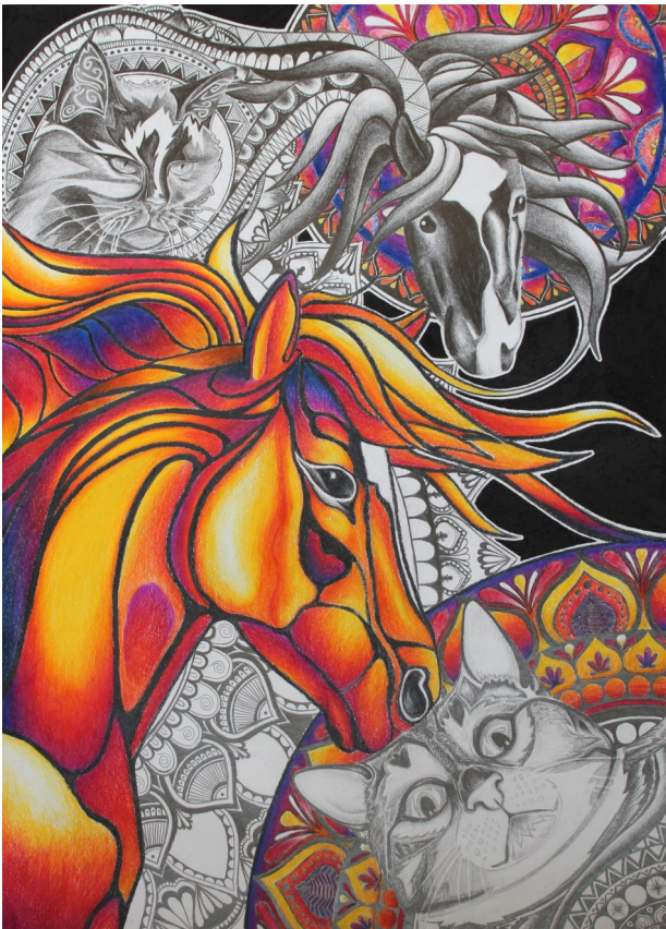
By Isy Maclean, S6