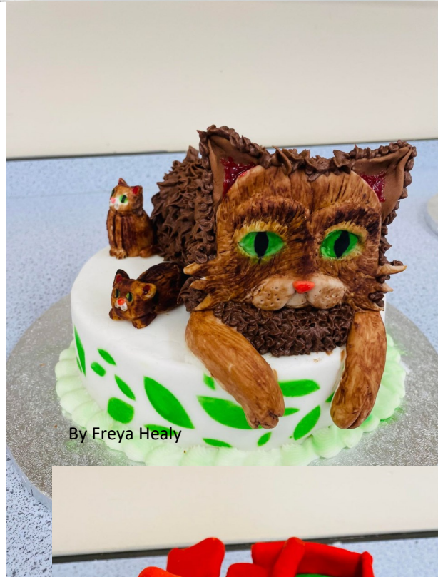
By Freya Healy