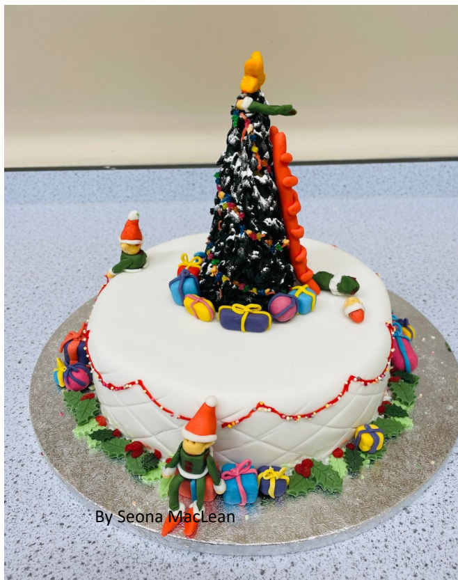
By Seona MacLean