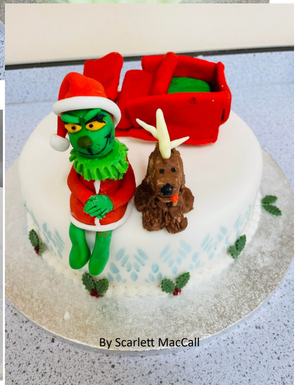
By Scarlett MacCall